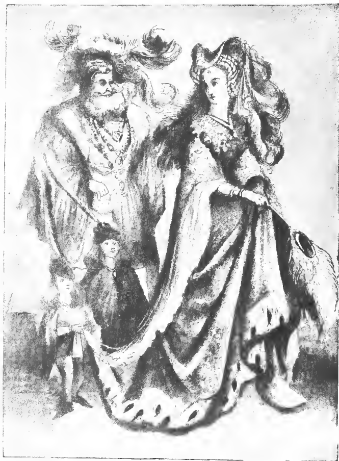
The King's Sweetheart